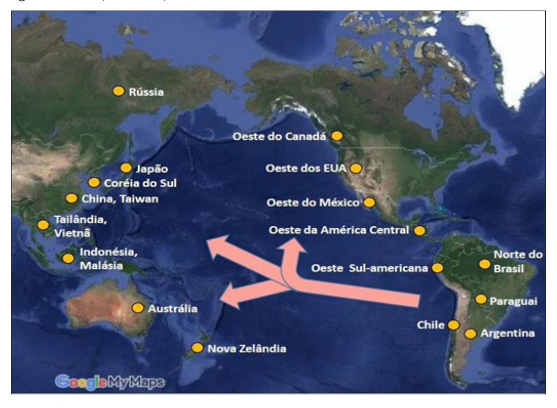
Figure 2 – Asia, Oceania, and the American West Coast