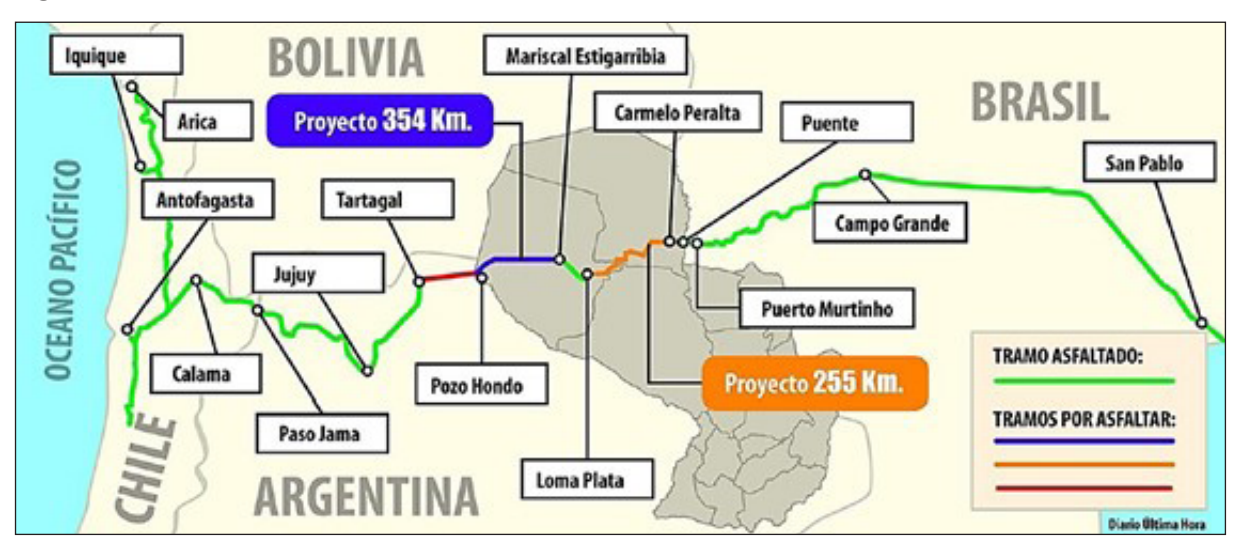
Figure 1 – UNIRILA Route

The Latin American Integration Route is a road corridor with a length of 2,396 kilometres, which will connect the Atlantic Ocean to the ports of Antofagasta and Iquique, in Chile, passing through Paraguay and Argentina. Its supporters argue that it would be an alternative to the Port of Santos (SP), since it will shorten the distance and time for Brazilian exports and imports between potential markets in Asia, Oceania, and the West Coast of the United States (Campos, 2022).